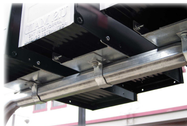
Mailbox bracket with U-Bracket

Shown with four Multiple Mailbox kits on a Multiple Mailbox Frame. Mailboxes and newspaper brackets are sold separately. Consult your state specifications for permissible amount of mailboxes.