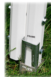
Frame, Wedge & Anchor

NEX® is protected by Canadian Patent #'s 2,369,517; 2,310,486 of S-Square Tube Products, Inc.